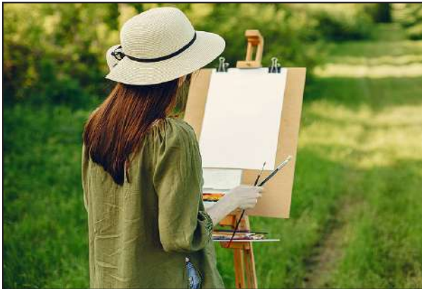
Funding a new Artist in Residence Program and adapting an under-utilized shed into a new studio space.