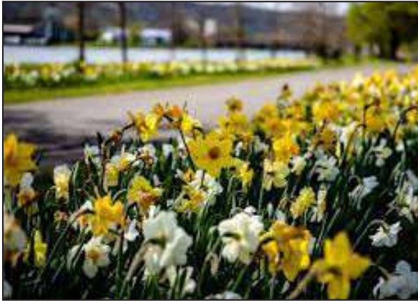
Planting 50,000 daffodils (Evelyn Field's favorite flower) along the park entrance and around loop road in honor of the 100th Anniversary of the NYS Park's System.