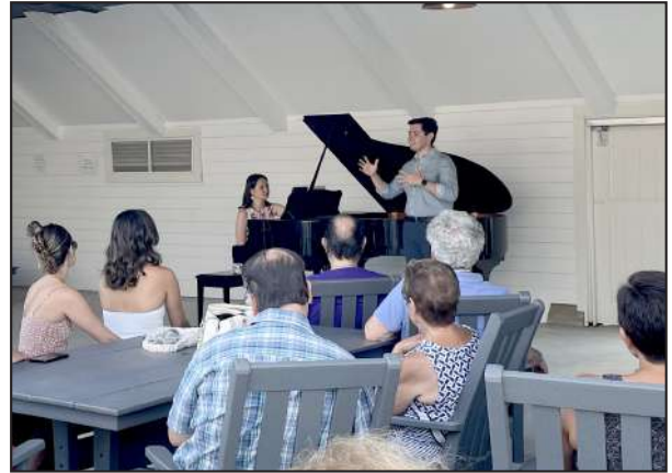
Continuing "Concert Fridays" with diverse performances and other free public programming