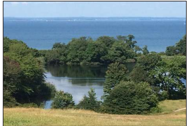
Combating erosion behind the Main House, first by studying the site, then designing a solution and developing an enhanced ecological community and adding accessibility