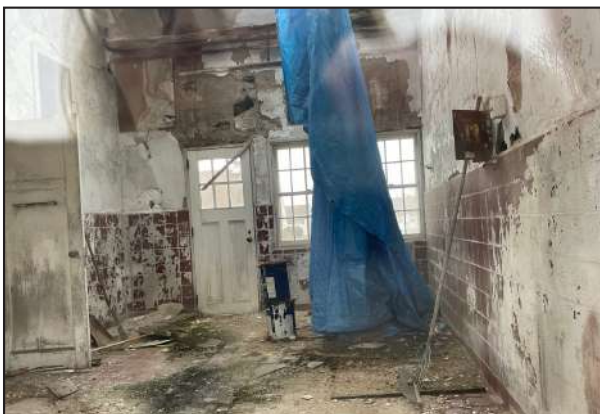
Restoring the historic Dairy Building into an Interpretive Center by first remediating the asbestos and lead paint